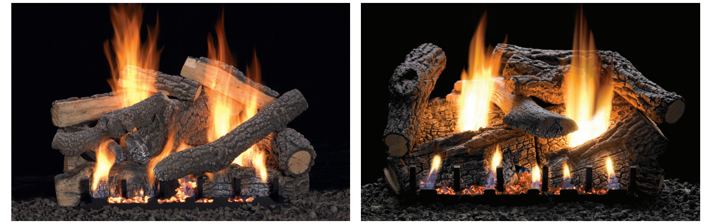
Ponderosa Refractory Log Set (LS24P)