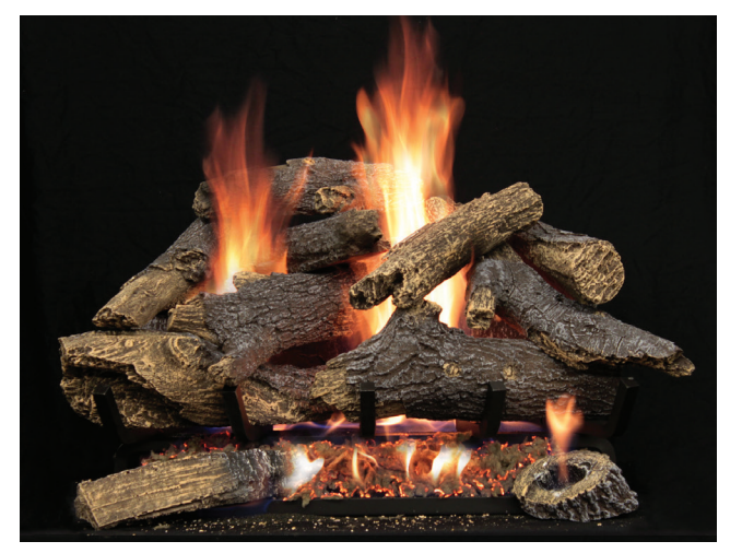
Pioneer (LPR) Refractory Log Set