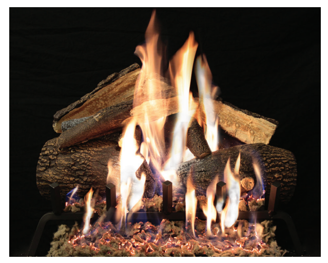
Advantage (LA) Refractory Log Set shown with Triple Burner