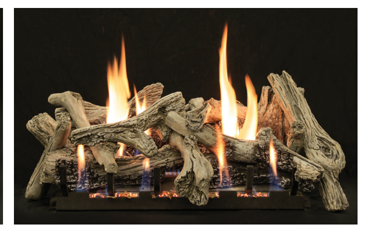
Driftwood Burncrete® Log Set (LS24CD)