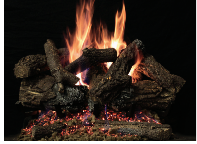
Treehouse 11 (LTH11) Refractory Log Set