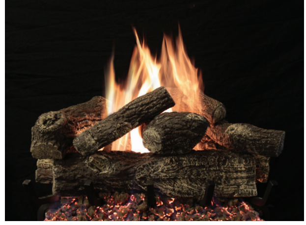
Treehouse 7 (LTH7) Refractory Log Set