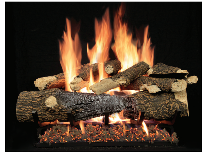
Frontier (LFR) Refractory Log Set