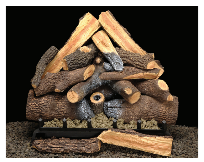
Advantage Refractory Log Set shown with Skyscraper (LAV) Accessory Refractory Logs