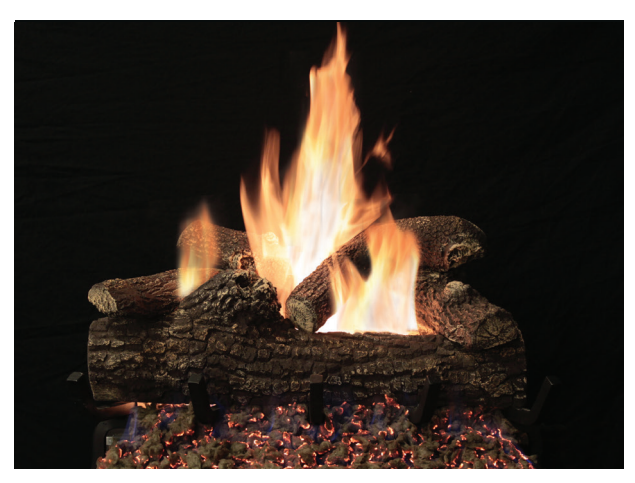
Great Lakes Oak (GLO) Refractory Log Set