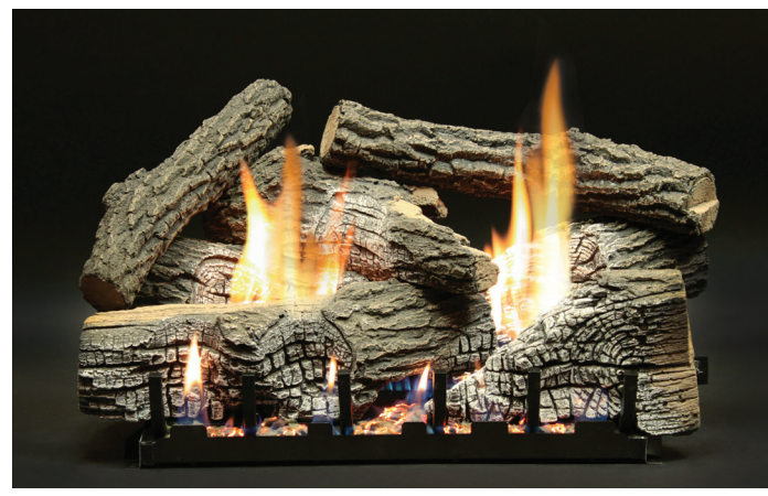
Super Stacked Wildwood Refractory Log Set (LS24WRS)