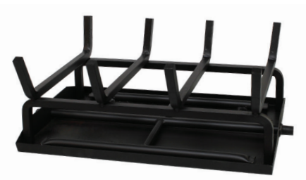
See-Through Burner (B3) (requires See-Through Log Set)