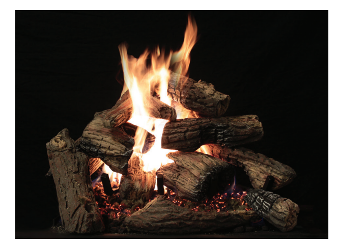
Kensington Forest (LKF) Ceramic Fiber Log Set