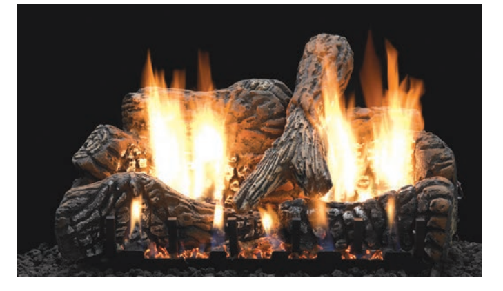
Charred Oak Ceramic Fiber Log Set (LS-24C2) with Vent-Free Slope Glaze Burner System (VFSR-24)