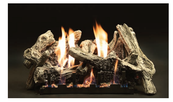
Driftwood Burncrete® Log Set (LS-18CD) with Vent-Free Slope Glaze Burner System (VFSR-18)