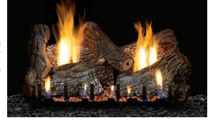
Sassafras Refractory Log Set (LS-24RS) with Vent-Free Slope Glaze Burner System (VFSR-24)