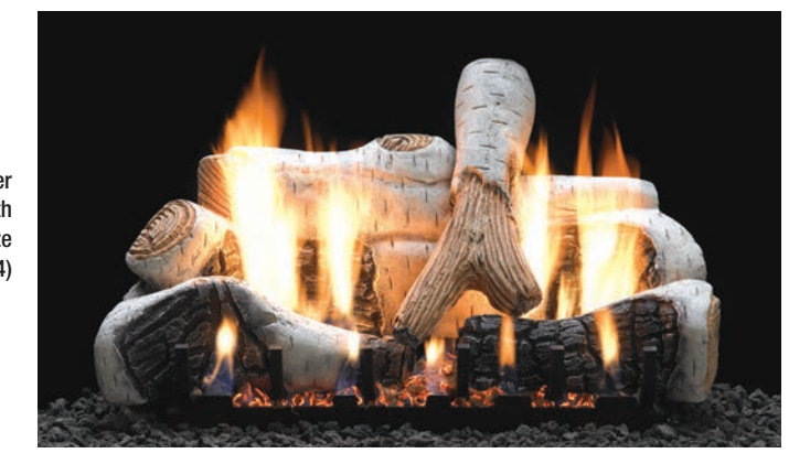
Birch Ceramic Fiber Log Set (LS-24B2) with Vent-Free Slope Glaze Burner System (VFSR-24)