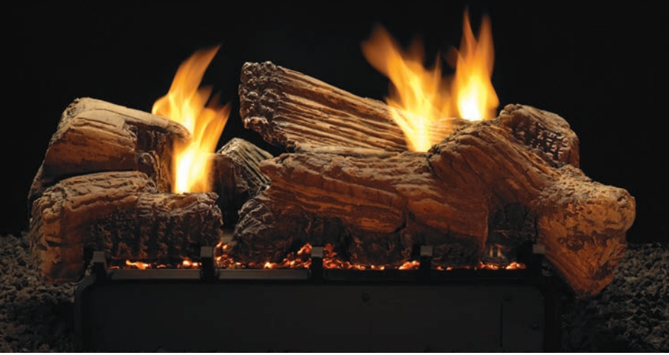
The Stone River Ceramic Fiber Log Set (LSU-24SF) provides a different look from every angle. The Vent-Free Slope Glaze Vista Burner (VFSUR-24) neatly conceals its controls behind a sliding panel.