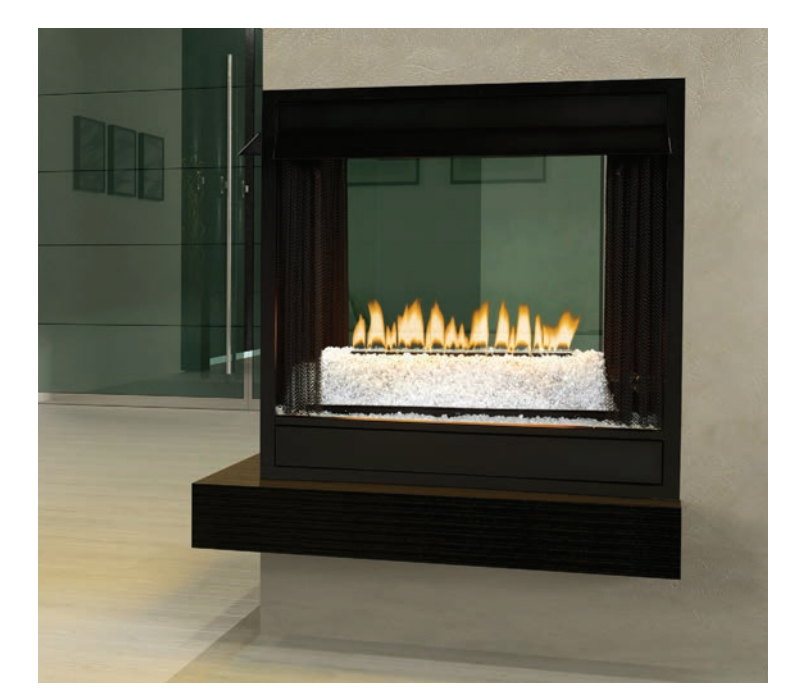
Loft Series Vent-Free Multi-sided burner (VFRU-24) with Clear Frost Decorative Glass (DG-30-CLF). Shown in a Vent-Free peninsula firebox with Flush Louvers.