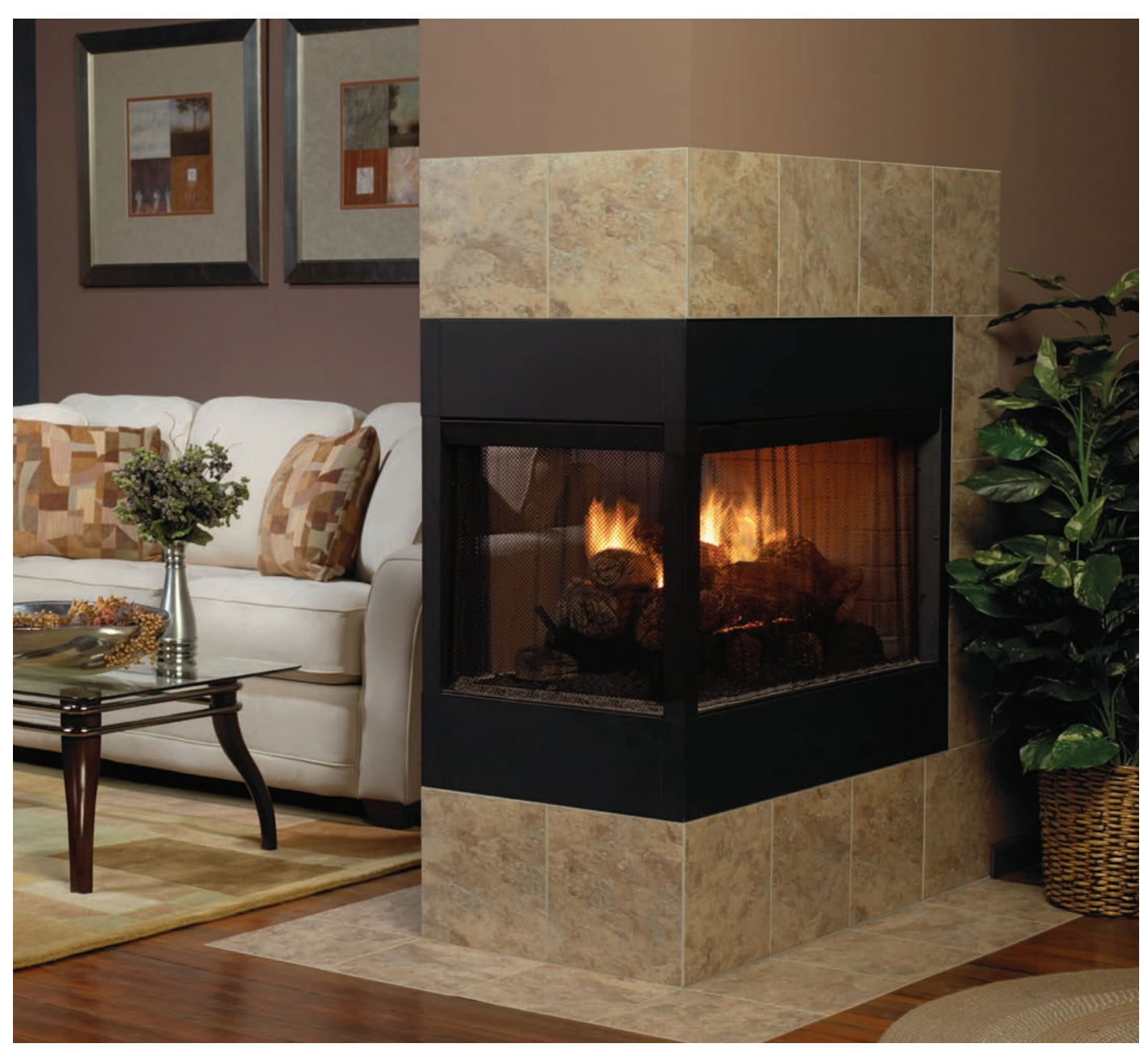
White Mountain Hearth Stone River Log Set (LSU-24SF) on a Vent-Free Slope Glaze Vista Burner. Shown in a peninsula firebox with custom tile surround. The optional Large Log Embers Kit (EK-2) and Platinum Glowing Embers (PE20) add that extra spark of realism.