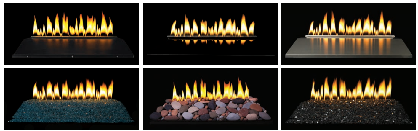
Top Row left to right: No Decorative Options, Polished Black Decorative Top, Brushed Stainless Steel Decorative Top. Bottom Row left to right: Blue Clear Decorative Glass, Medium Decorative Rocks and Accent Pebbles, Polished Black Decorative Glass. (Clear Frost Decorative Glass shown on opposite page)