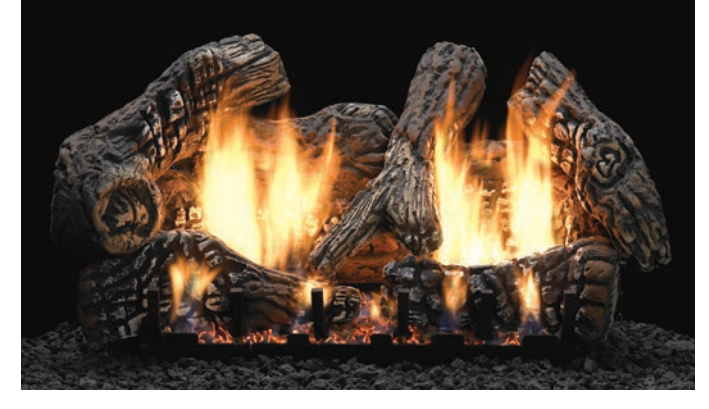
Super Charred Oak Ceramic Fiber Log Set (LS-24C2S) with Vent-Free Slope Glaze Burner System (VFSR-24)