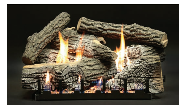
Super Stacked Wildwood Refractory Log Set (LS24WRS) with Vent-Free Slope Glaze Burner System (VFSR-24)

Stacked Wildwood Refractory Log Set (LS24WRR) with Vent-Free Slope Glaze Burner System (VFSR-24)