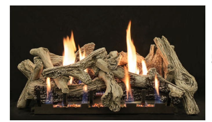
Driftwood Burncrete® Log Set (LS-24CD) with Vent-Free Slope Glaze Burner System (VFSR-24)