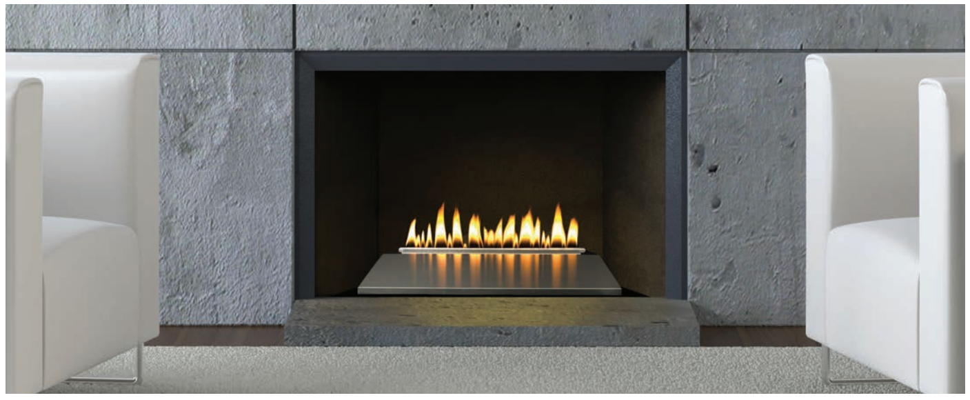
Loft Series Vent-Free Burner (VFRL-24) with Stainless Steel Decorative Top (DT-24-SS). Shown in existing masonry firebox.

A vent-free Millivolt Loft Burner may also be installed as a decorative appliance in a vented fireplace to provide ambiance and light – but without the heat. In a vented installation, the burner cannot be operated by thermostat, and the flue damper must be blocked open. A damper clamp is included with all Loft burners. Because IP Loft Burners include a thermostat remote and may not be installed as decorative appliances, a non-thermostat remote is available.