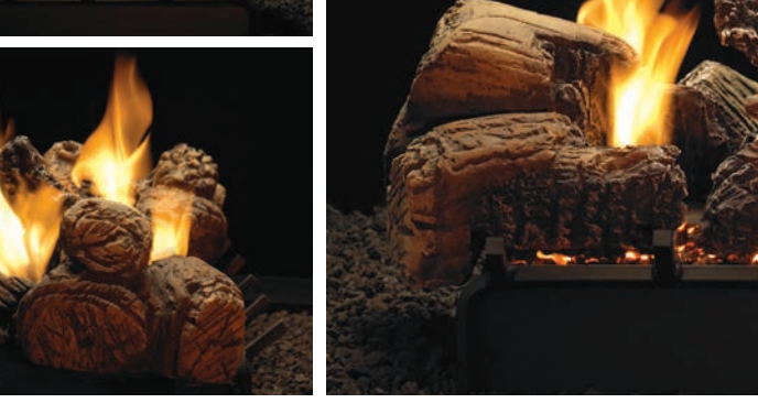
Opposite Side View (above) and End View (below)