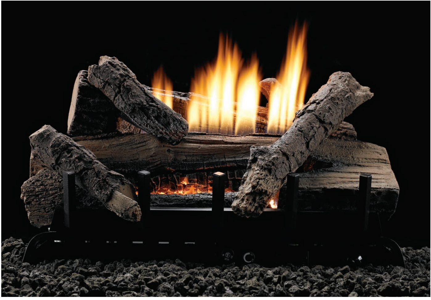
Whiskey River Refractory Log Set and Vent-Free Burner Combination (VFDR-18-LBW)

The Flint Hill and Whiskey River are also offered in 10,000 Btu models for bedroom applications, where allowed by code.