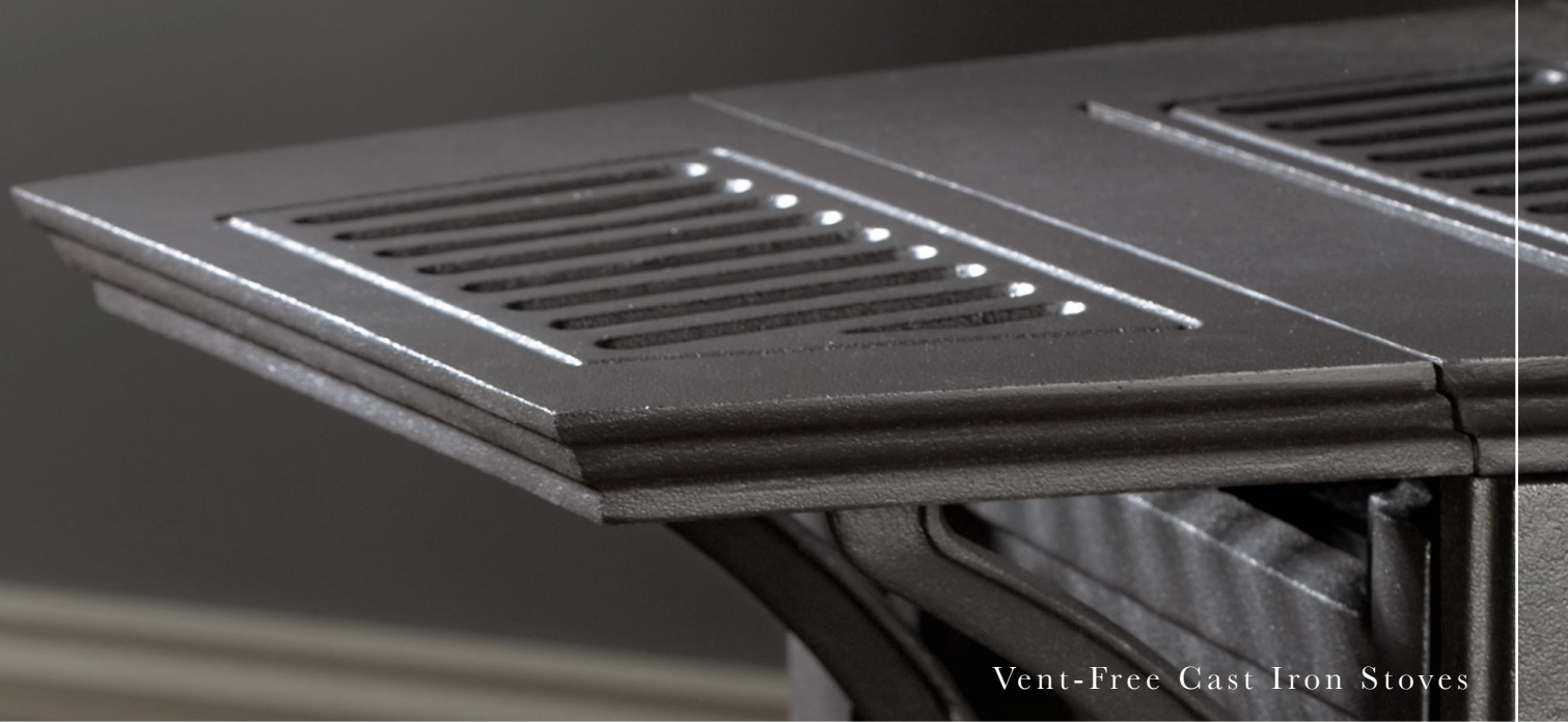
Vent-Free Cast Iron Stoves