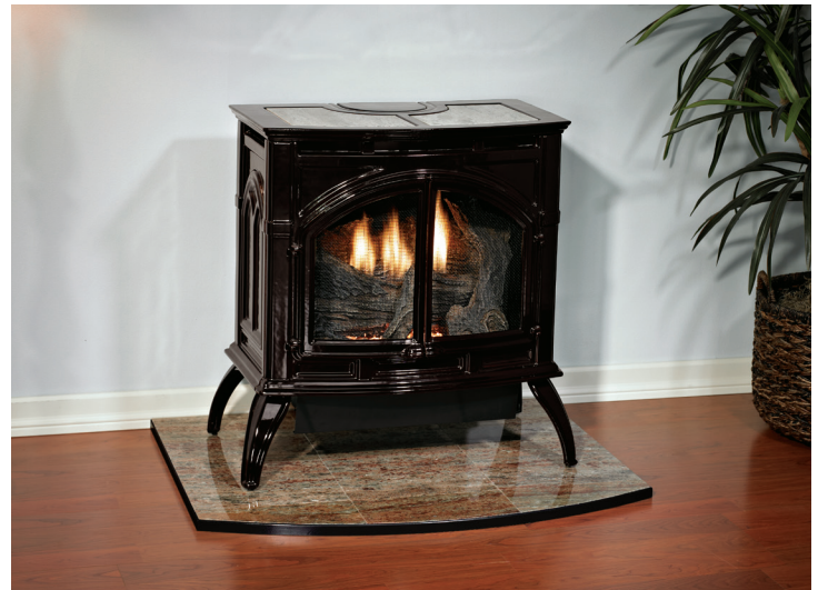
Empire Medium Vent-Free Stove in Porcelain Mahogany with optional Floor Pad