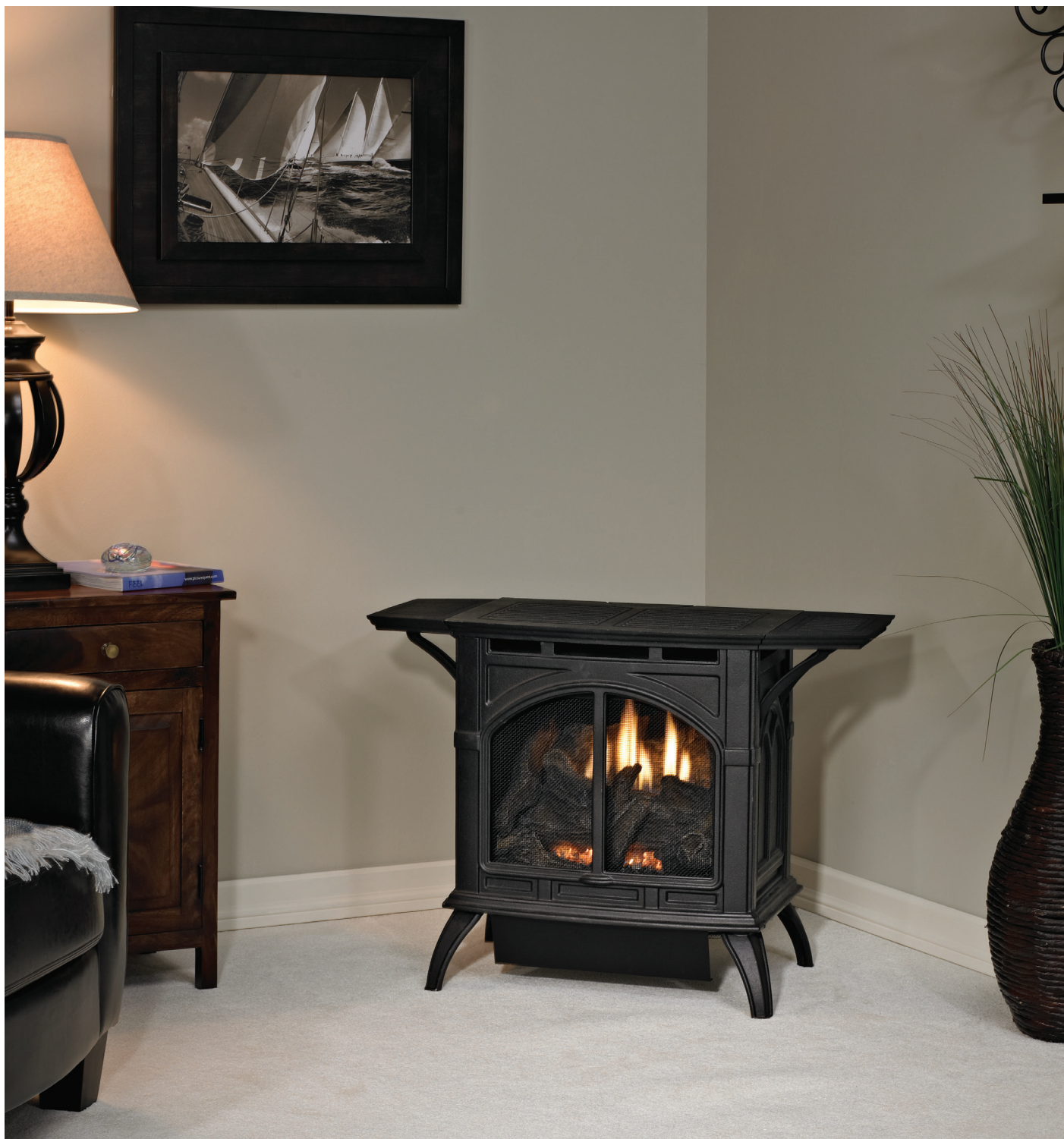
Empire Compact Vent-Free Stove in Matte Black with optional Side Shelves