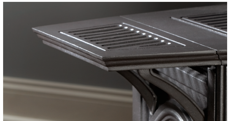
Optional Matching Side Shelf Kit