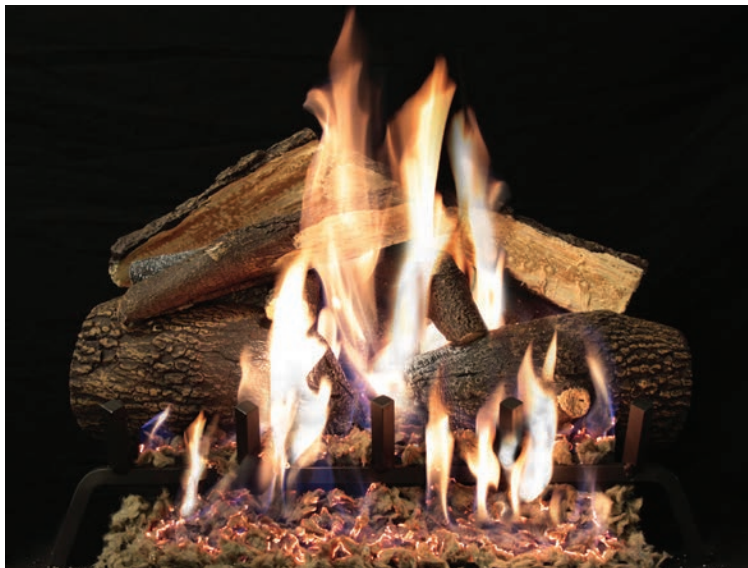
Advantage (LA) Refractory Log Set shown with Triple Burner