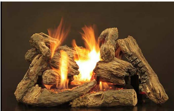
Kensington Forest 24-Inch (LKF) Ceramic Fiber Log Set