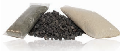
Embers, Rock and Sand (included with all Double and See-Through Burners)