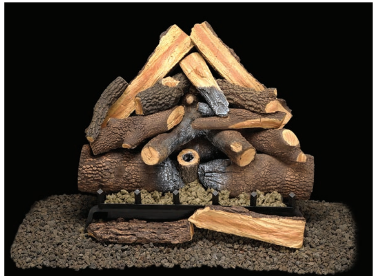
Advantage Refractory Log Set shown with Skyscraper (LAV) Accessory Refractory Logs