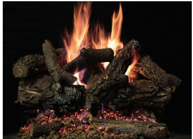
Treehouse 11 (LTH11) Refractory Log Set