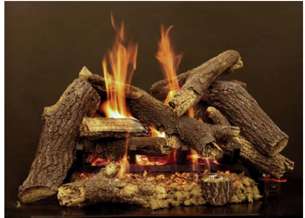
Pioneer (LPR) Refractory Log Set