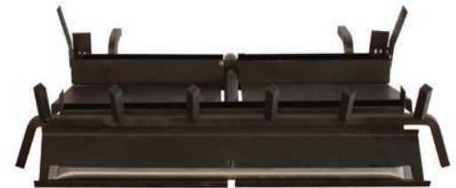
Triple Burner (AV)