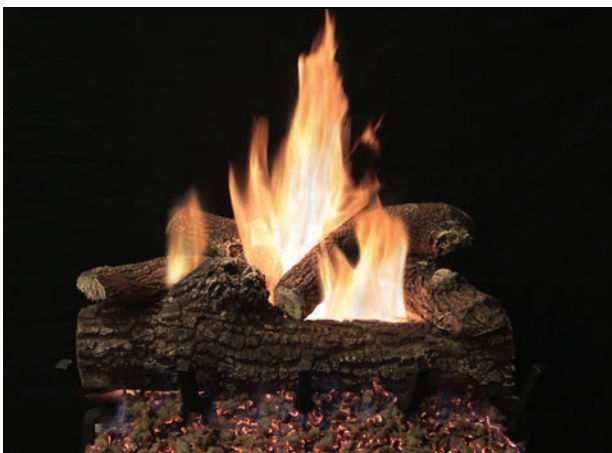
Great Lakes Oak (LGLO) Refractory Log Set