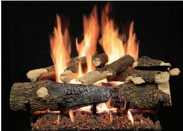
Frontier (LFR) Refractory Log Set