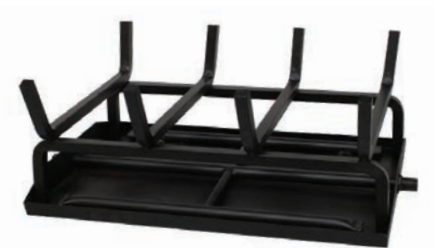
See-Through Burner (B3) (requires See-Through Log Set)