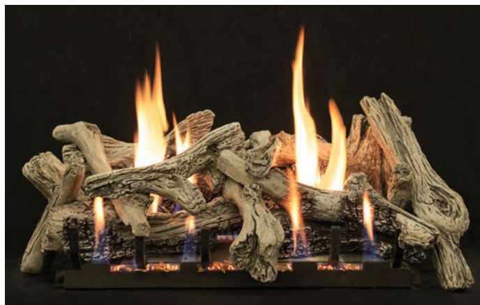
Driftwood Burncrete® Log Set (LS24CD)