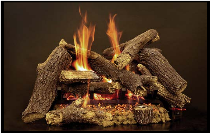
Pioneer 24-Inch (LPR) Refractory Log Set