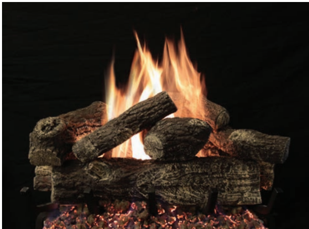
Treehouse 7 (LTH7) Refractory Log Set