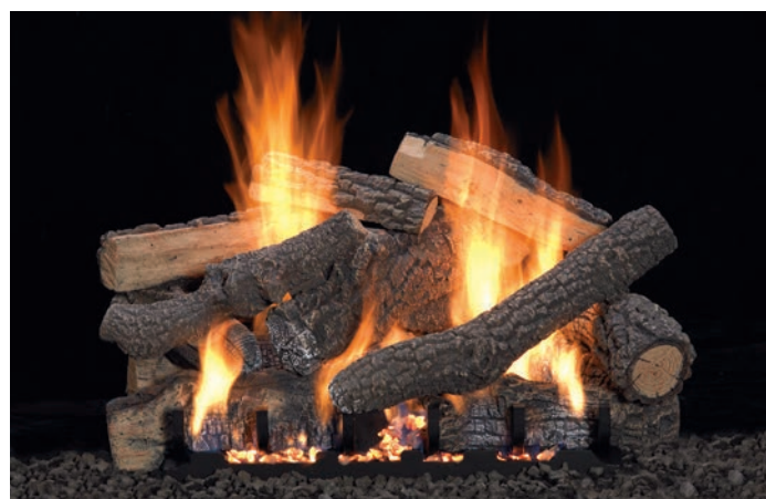
Ponderosa Refractory Log Set (LS24P)