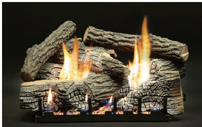
Super Stacked Wildwood Refractory Log Set (LS24WRS)