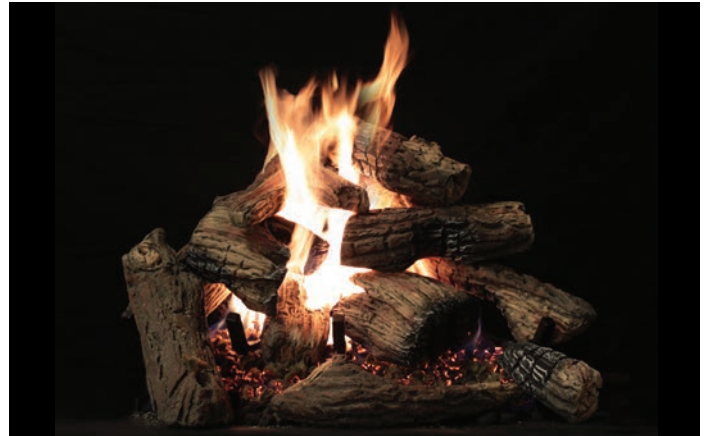
Kensington Forest 18-Inch (LKF) Ceramic Fiber Log Set